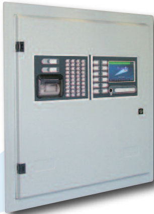
ZFP Standard Cabinet (PART NUMBERS ON PAGE 8)