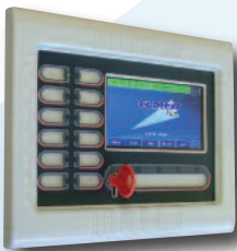
Compact Repeaters (PART NUMBERS ON PAGE 8)