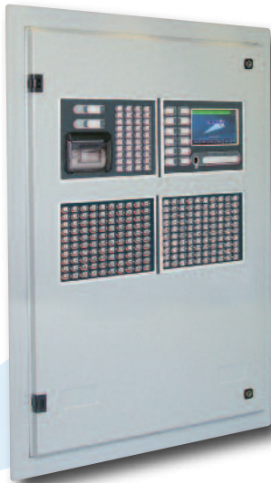
ZFP Medium Cabinet (PART NUMBERS ON PAGE 8)